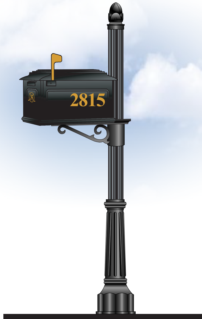
M5 Mailbox on DB 05 "S" bracket w/ fluted post, 2PC-3 base and A3 finial